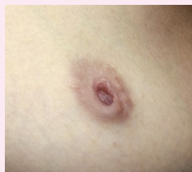
A newly inverted nipple? Get checked.

Most women know to get a lump checked out. Fortunately most lumps aren't cancerous with nine out of ten proving benign. The Foundation recommends that women get any changes to the breast or nipple checked out by a health professional.